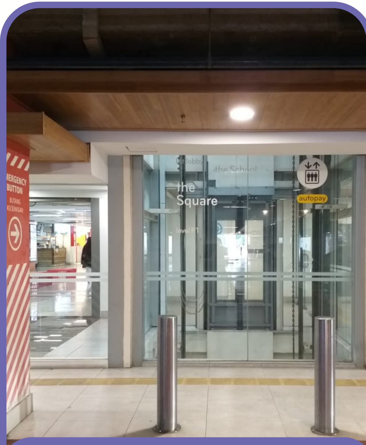
Level P1 Car Park